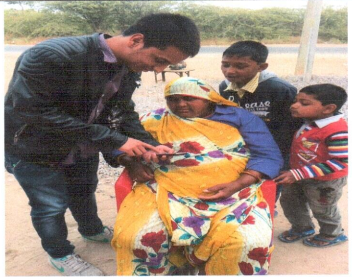
Figure 2 Saksharta avam Banking awarness in Villages, 8/4/2019